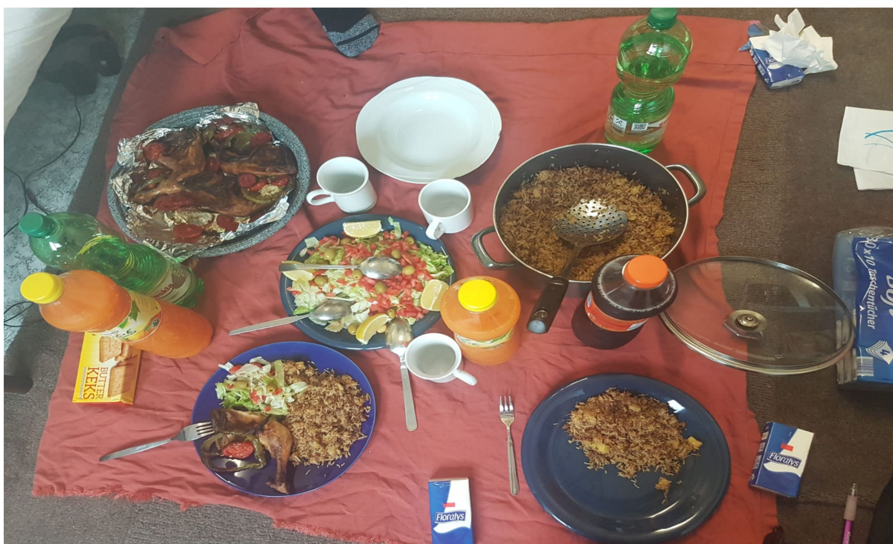
Home-made meal in a refugee reception center in Bonn. Photo: Elene Shubladze, September 2019.