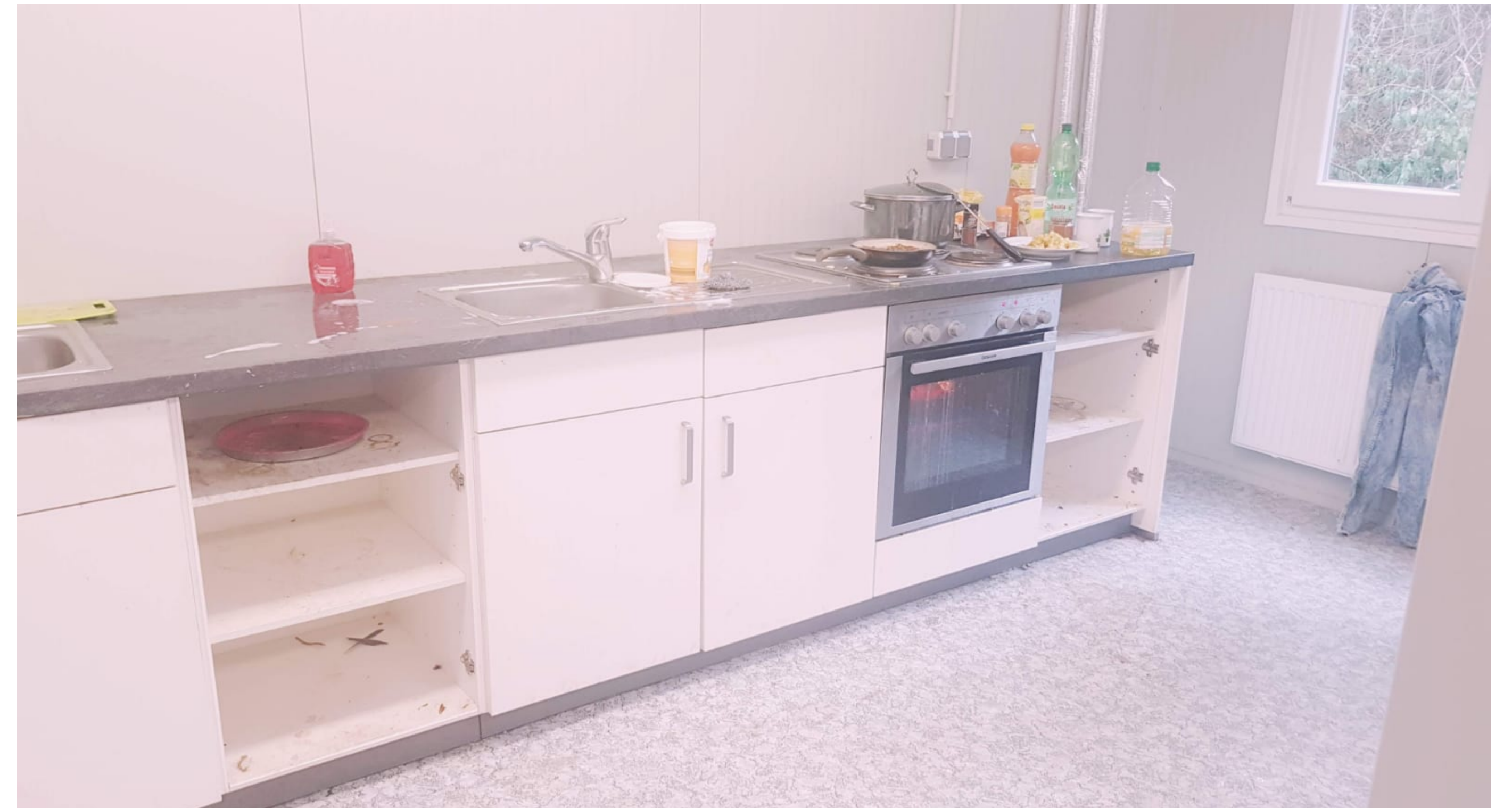
Kitchen in a refugee reception center in Bonn. Photo: Elene Shubladze, September 2019.

The research was conducted between July and October 2019. The methods used were participant observation, informal conversations and semi-structured interviews with 16 refugees from the Middle East.